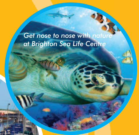
Get nose to nose with nature at Brighton Sea Life Centre