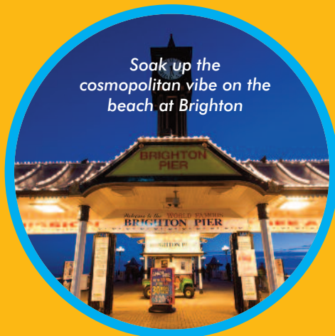
Soak up the cosmopolitan vibe on the beach at Brighton

the Sea Life Centre or don your cultural hat for a visit to Brighton and Hove Museums. A unique mix of heritage, culture and cosmopolitan fun, Brighton attractions cater for all tastes and budgets.